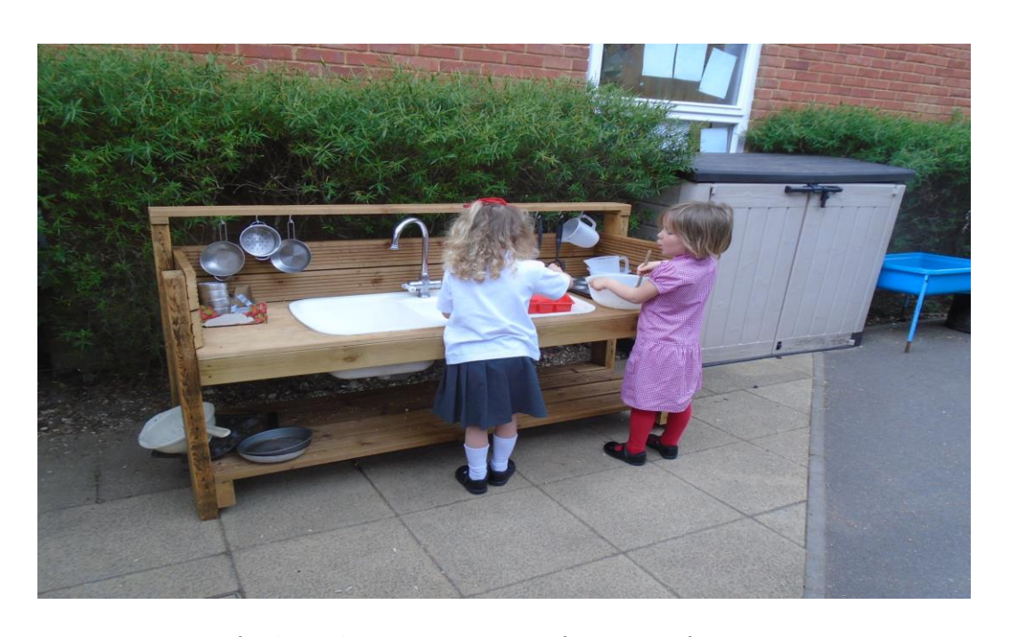
This is our play den